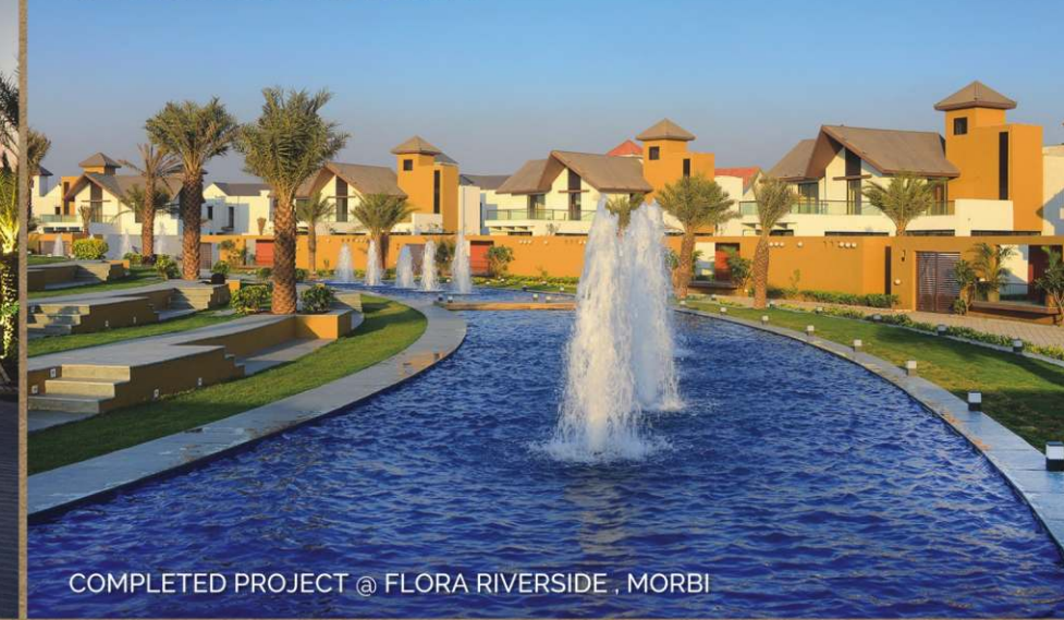
COMPLETED PROJECT @ FLORA RIVERSIDE , MORBI