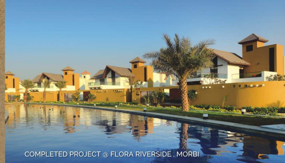
COMPLETED PROJECT @ FLORA RIVERSIDE , MORBI