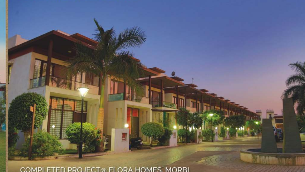
COMPLETED PROJECT @ FLORA HOMES, MORBI