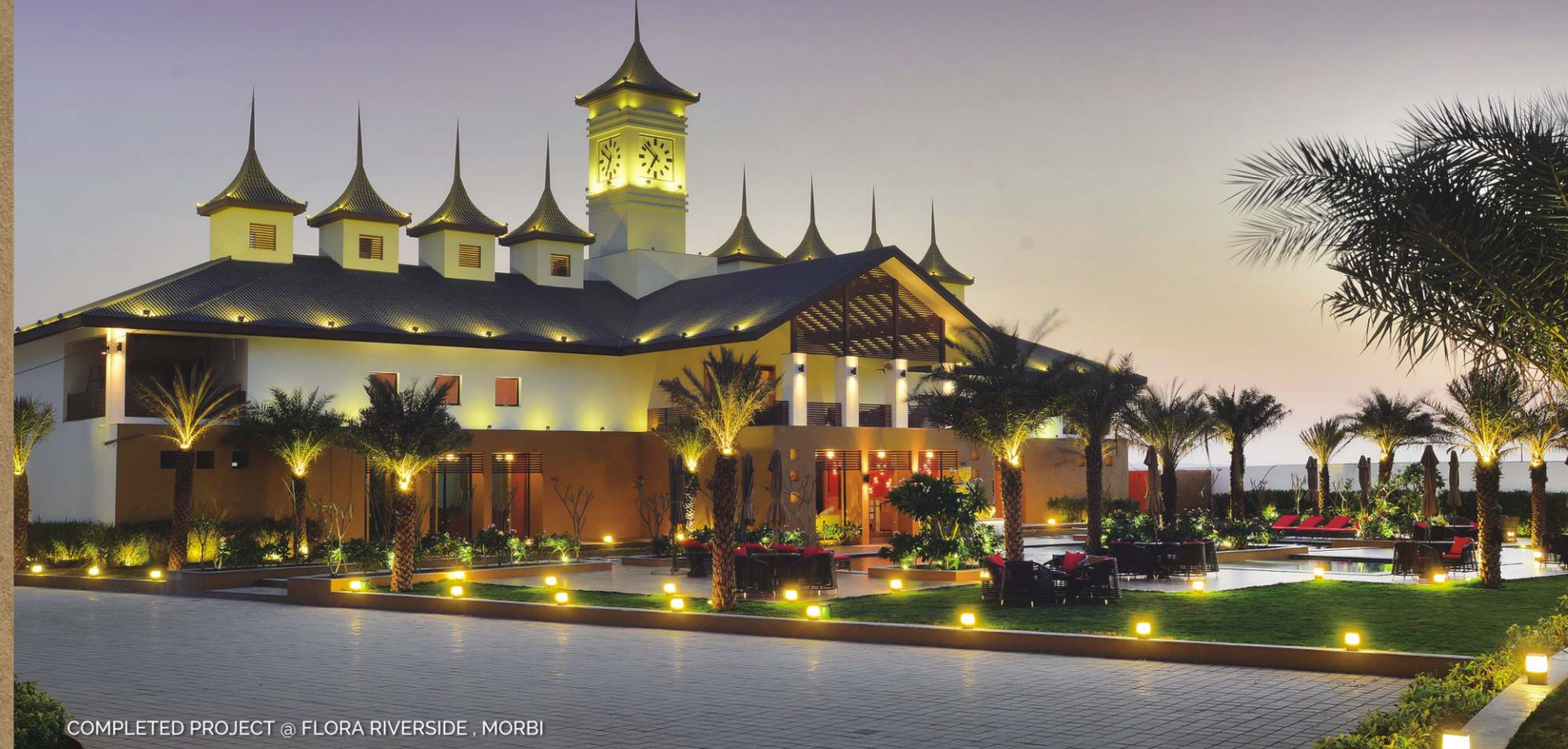
COMPLETED PROJECT @ FLORA RIVERSIDE , MORBI