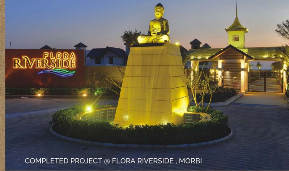
COMPLETED PROJECT @ FLORA RIVERSIDE , MORBI