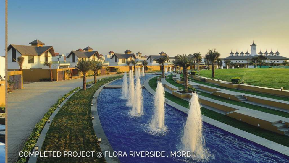
COMPLETED PROJECT @ FLORA RIVERSIDE , MORBI