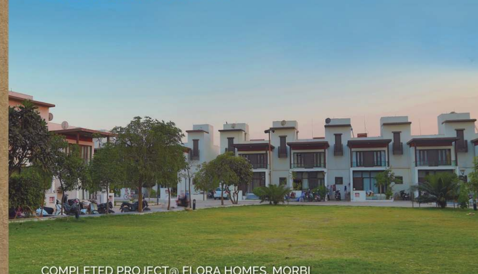
COMPLETED PROJECT @ FLORA HOMES, MORBI